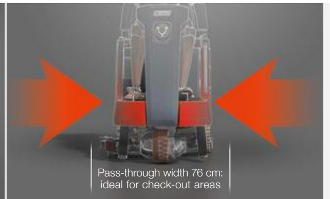
Pass-through width 76 cm: ideal for check-out areas