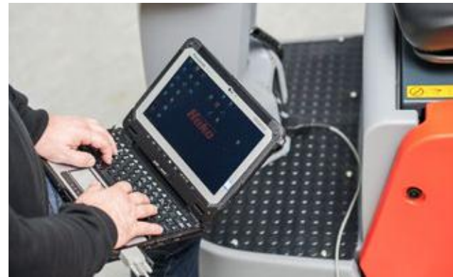
Easy access to the diagnosis interface for maintenance purposes and to modify machine settings.

Blue Competence is an initiative of VDMA ( www.vdma.org ). By engaging in this partnership, we are committed to comply with the twelve sustainability principles applied in the field of mechanical and system engineering ( www.bluecompetence.net/about ).