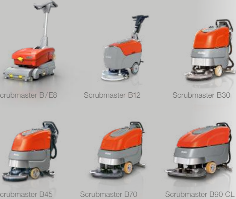
Scrubmaster B/E8 Scrubmaster B12 Scrubmaster B30 Scrubmaster B45 Scrubmaster B70 Scrubmaster B90 CL

Ease of use, ergonomic steering bar, and clever details that simplify your work routine: Each walk-behind scrubber-drier offers outstanding comfort for efficient working days as a standard!