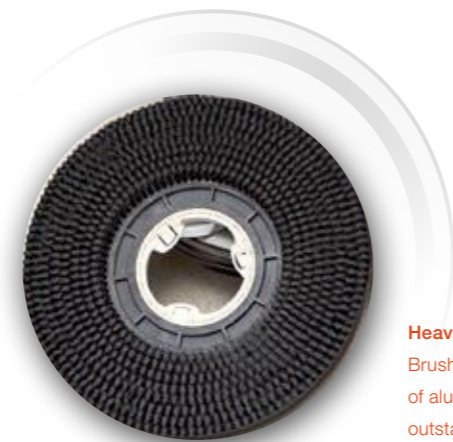
Heavy-duty design Brush units and squeegees made of aluminium die cast provide outstanding reliability.