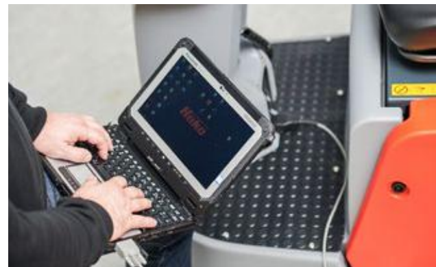
Easy access to the diagnosis interface for maintenance purposes and to modify machine settings.

Blue Competence is an initiative of VDMA ( www.vdma.org ). By engaging in this partnership, we are committed to comply with the twelve sustainability principles applied in the field of mechanical and system engineering ( www.bluecompetence.net/about ).