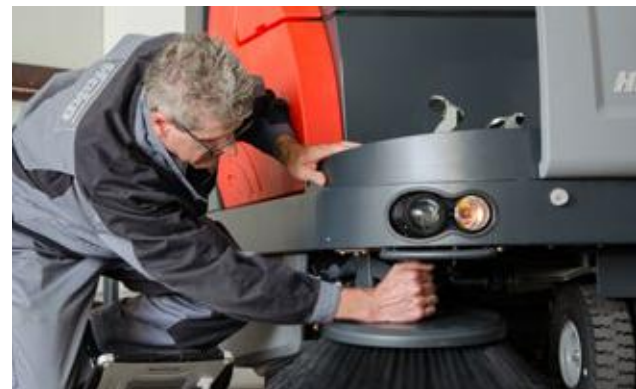
Easy access to all relevant components ensures uncomplicated maintenance and servicing.

Blue Competence is an initiative of VDMA ( www.vdma.org ). By engaging in this partnership, we are committed to comply with the twelve sustainability principles applied in the field of mechanical and system engineering ( www.bluecompetence.net/about ).