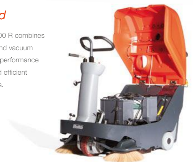
Clear structure All components are easily accessible to ensure uncomplicated maintenance.

The battery-powered Sweepmaster B800 R combines the compact dimensions of a walk-behind vacuum sweeper with the superior comfort and performance of a ride-on machine to provide fast and efficient cleaning of small to medium-sized areas.