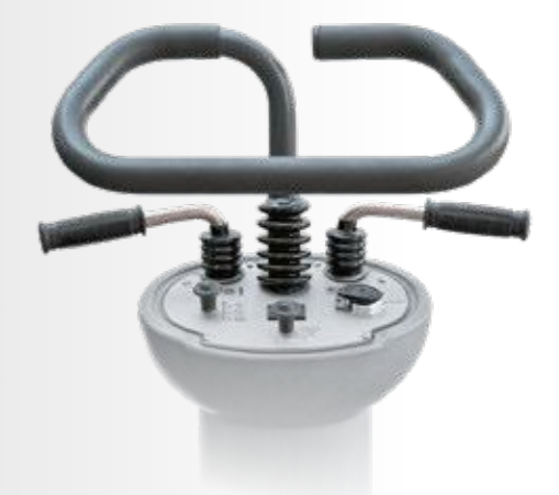
Comfortable workplace The large steering handle and the intuitive operating elements provide ease of use.